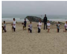
Beach Runs 2010