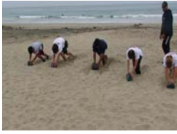
Beach Runs 2010